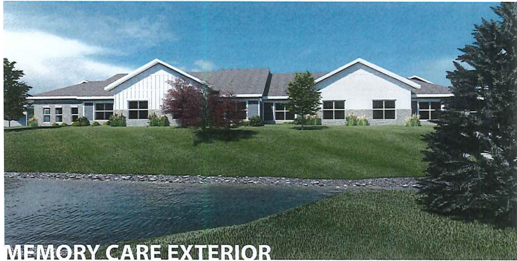
MEMORY CARE EXTERIOR