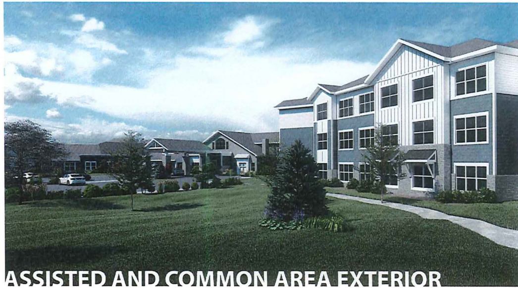
ASSISTED AND COMMON AREA EXTERIOR

DESIGN STYLE AND MATERIAL CHOICES BASED ON LOCAL JURSDICTION AND THEIR SPECIFIC REQUIRMENTS WEST DUNDEE DESIGN INTENDED TO WORK WITHIN CANTERFIELD DESIGN REQUIRMENTS